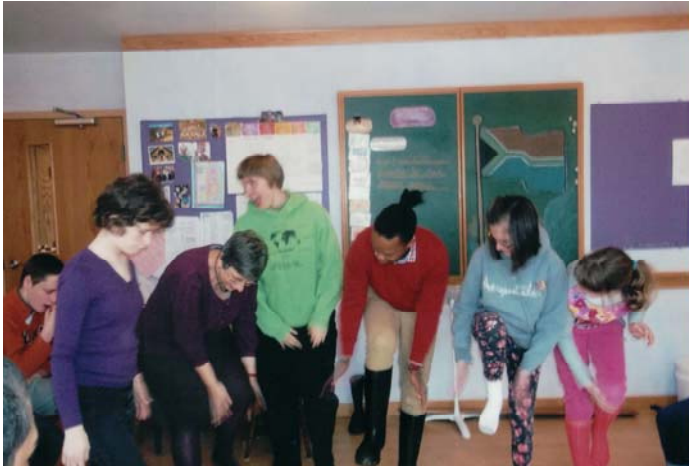
Grade eight does the gum boot dance