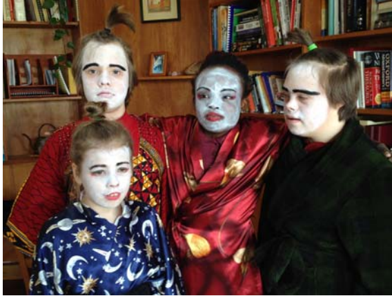
The students in Catalpa get dressed for "Japan"